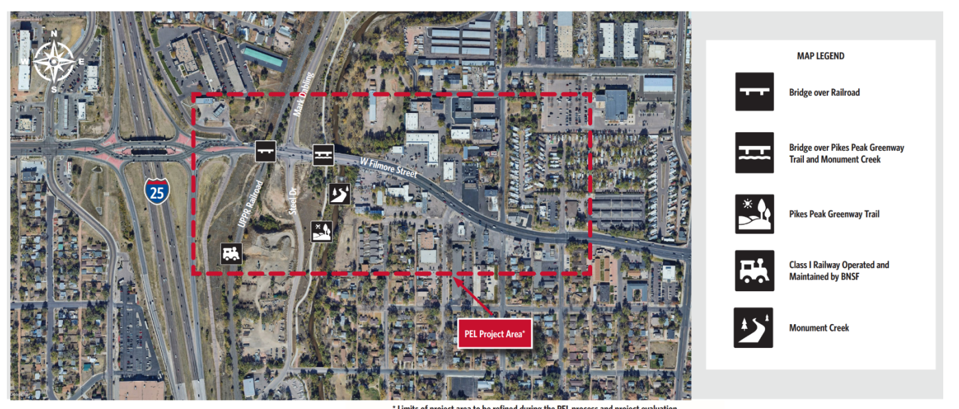
Limits of project area to be refined during the PEL process and project evaluation

Jolie also explained the environmental considerations in the project area, including wetlands and floodplains, threatened and endangered species, historic elements, and an environmental justice (EJ) community in the northeast corner of the identified project area.